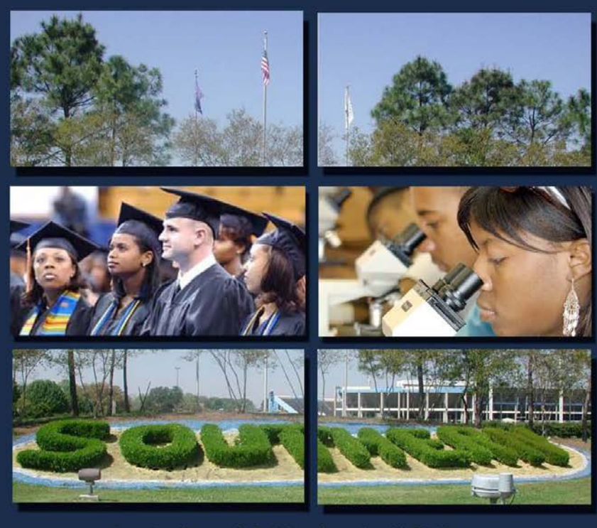
Agricultural & Mechanical College